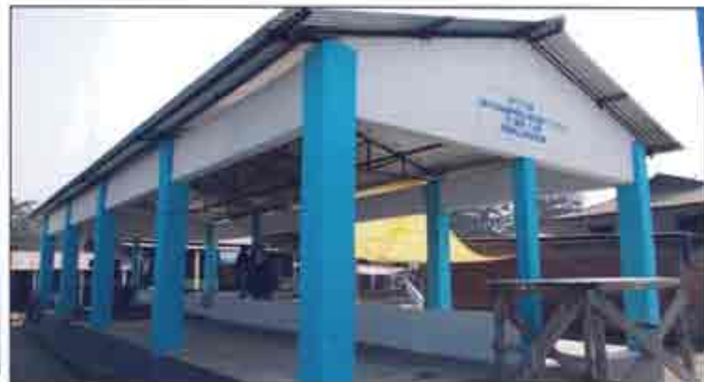
Construction of market shed at Bhuragaon weekly market (5 Units) E/A - 25.00L