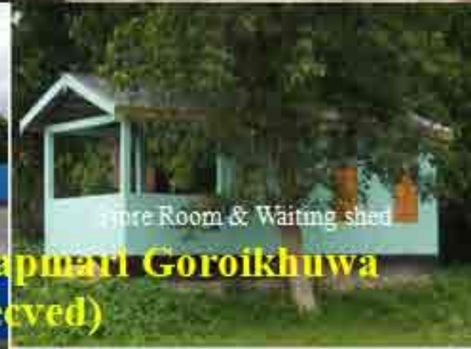
Fire Room & Waiting shed

Construction of Cremation Ground at Sapmarl Goroikhuwa EA- 16.00 L, (100% Achieved)