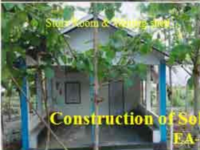
Shower Room & Changing shed