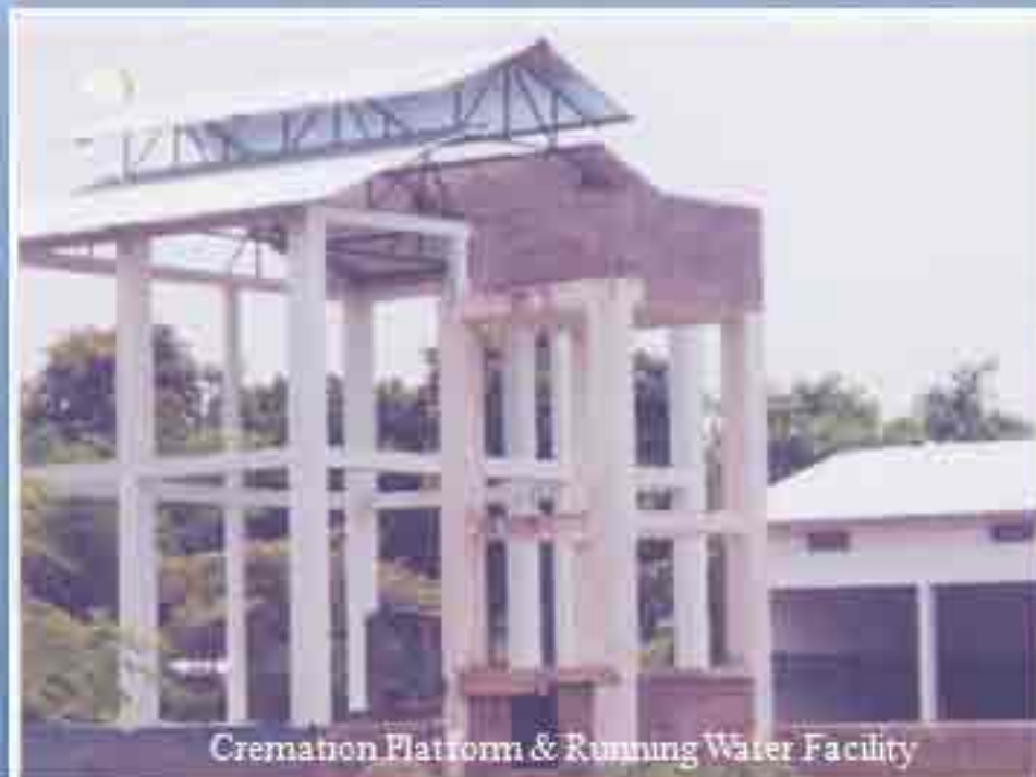
Cremation Platform & Running Water Facility