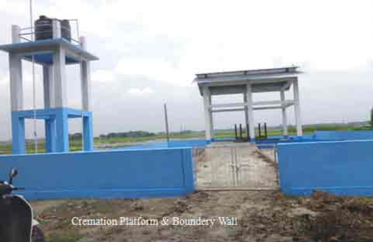
Cremation Platform & Boundery Wall