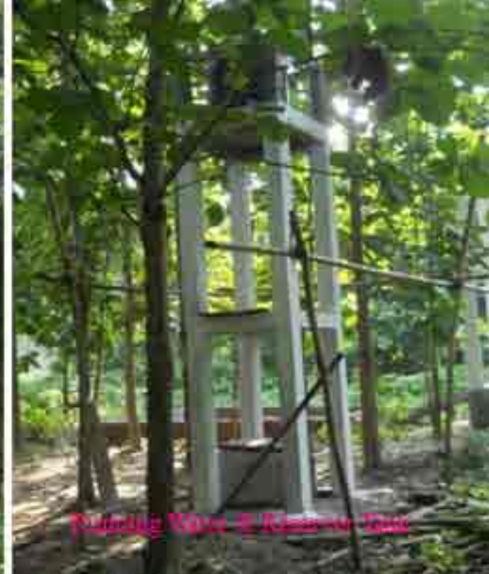
Rising Water to Room on Top