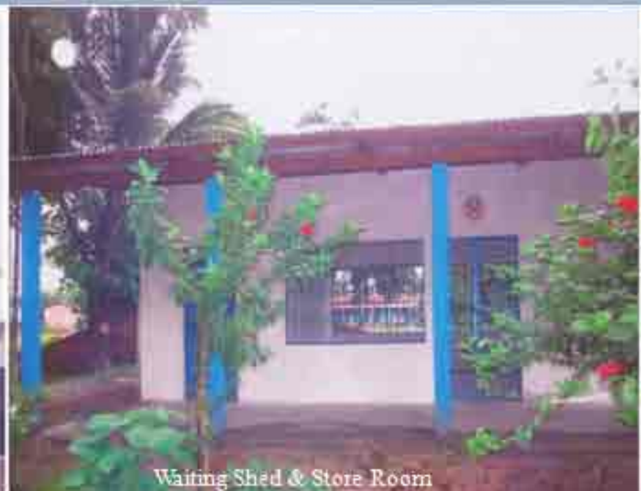
Waiting Shed & Store Room