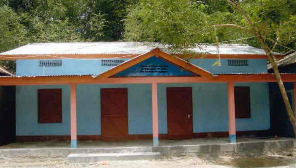
Community Hall constructed at Srijangram G.P. under 13th Finance Commission, 2011-12 (2nd Instl.) under Srijangram A.P.