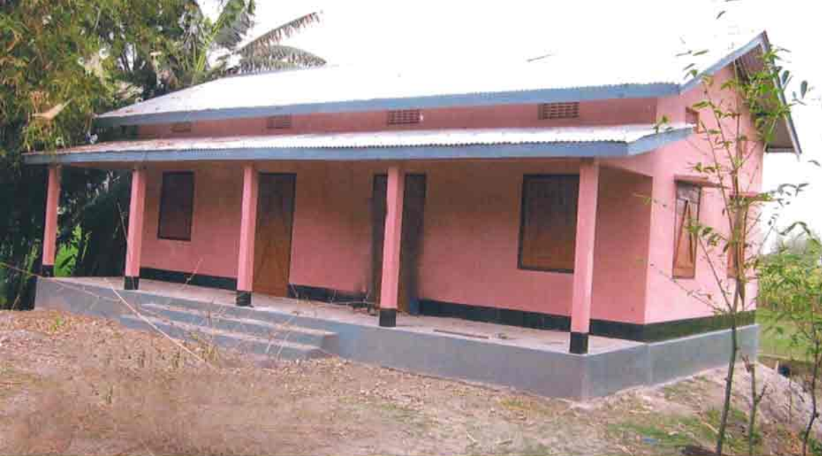
Const. of Community Hall at Sontoshpur-Dumerguri G.P. under 13th Finance Commission