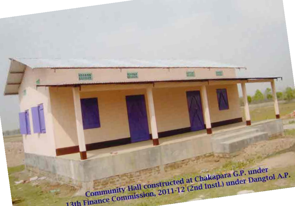
Community Hall constructed at Chakapara G.P. under 13th Finance Commission, 2011-12 (2nd Instl.) under Dangtol A.P.