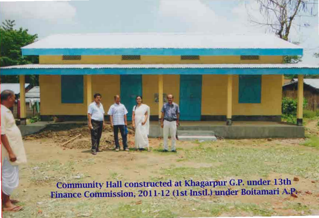
Community Hall constructed at Khagarpur G.P. under 13th Finance Commission, 2011-12 (1st Instl.) under Boitamari A.P.