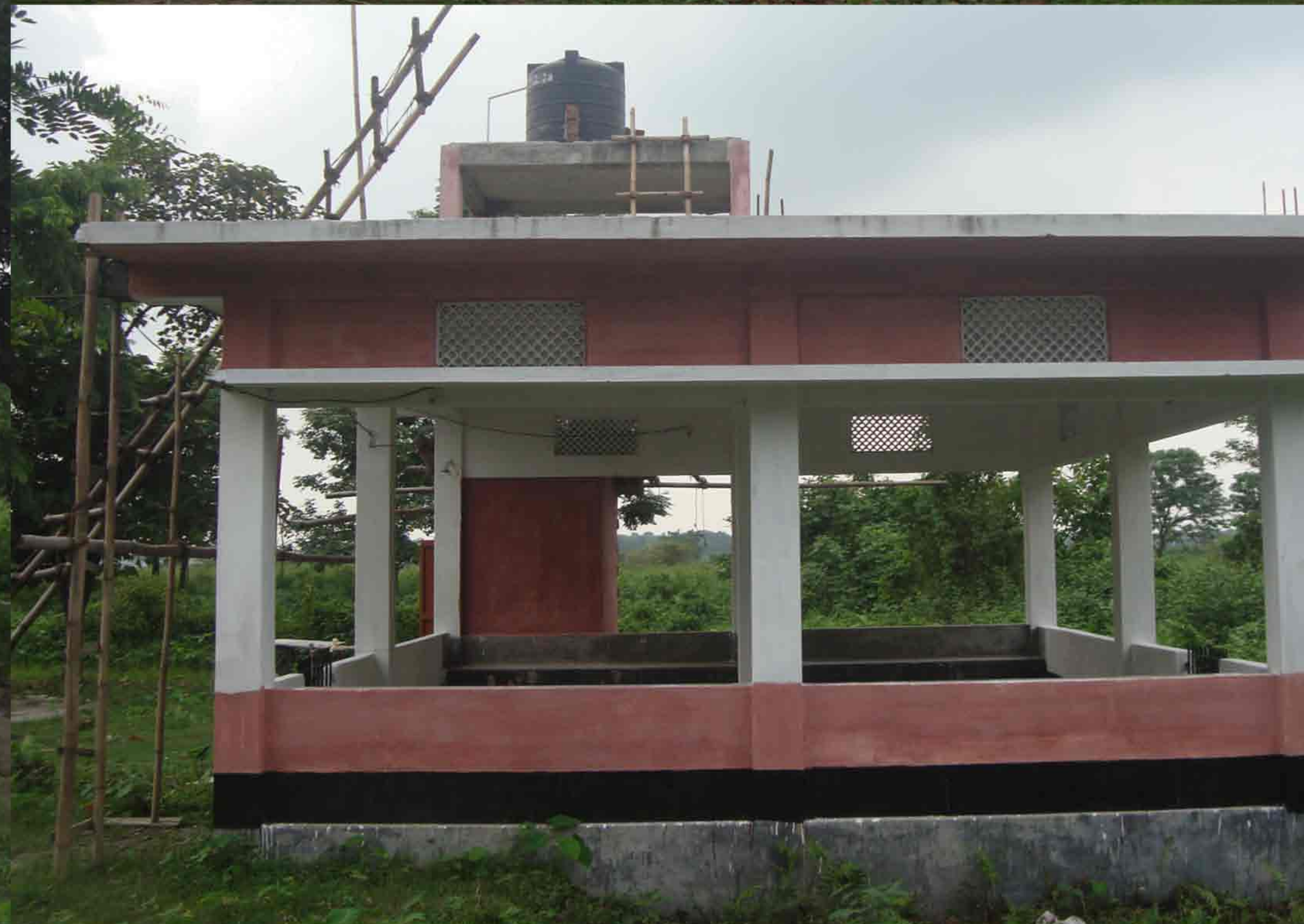
Const. of Jelkajhar Cremation Ground under Mulagaon G.P. (Dangtol A.P.) under 13th Finance Commissioner (General Performance Grant), 2012-13 (2nd instll.)