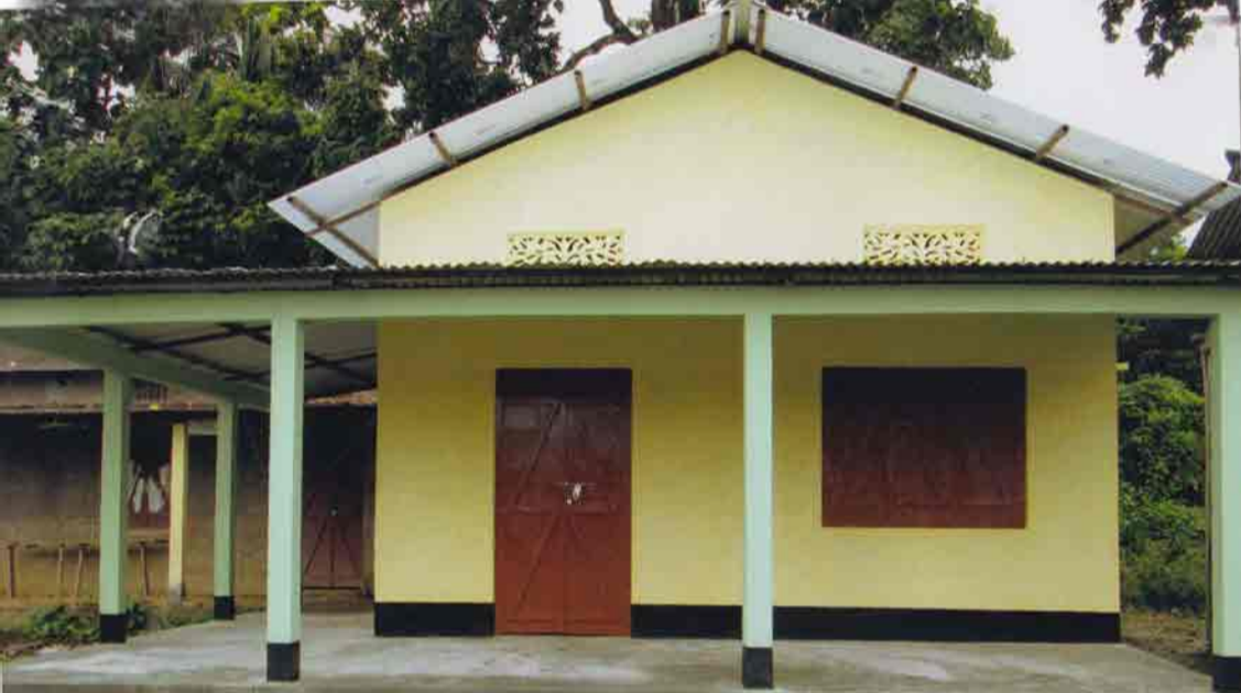
Const. of Community Hall at Chalantapara G.P. under 13th Finance Commission, 2012-13 (1st Installment) under Boitamari A.P.