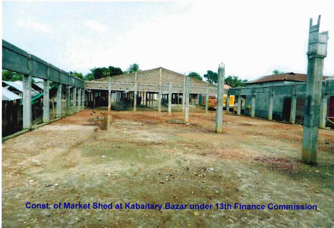
Const. of Market Shed at Kabaitary Bazar under 13th Finance Commission