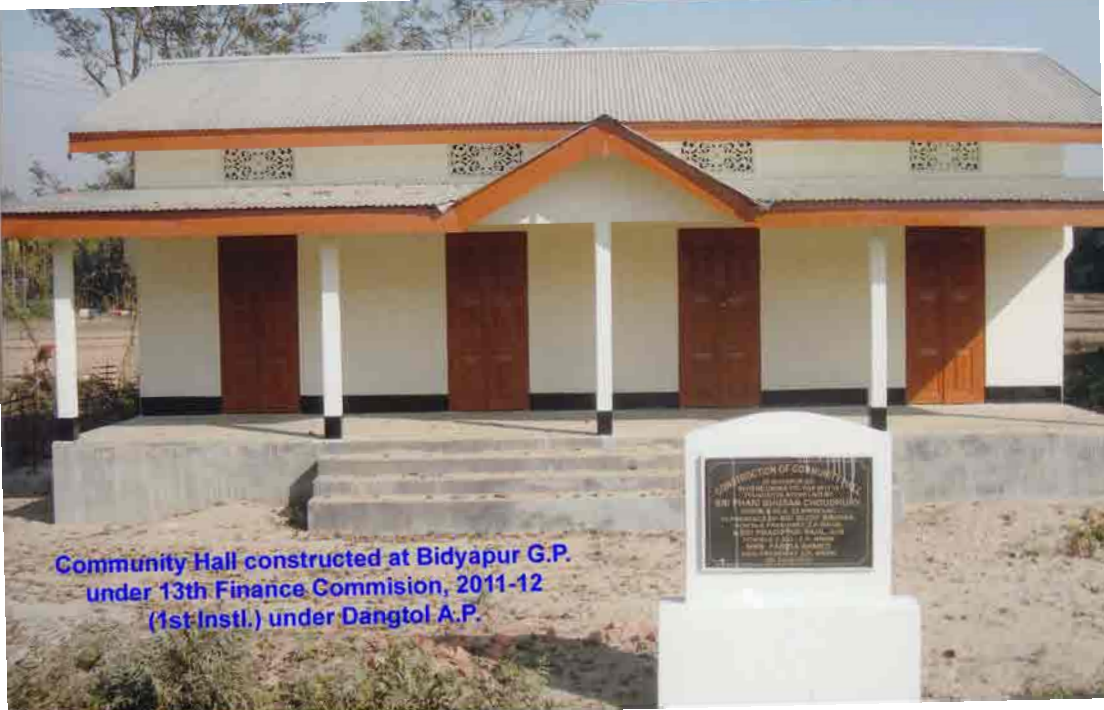
Community Hall constructed at Bidyapur G.P. under 13th Finance Commision, 2011-12 (1st Instl.) under Dangtol A.P.