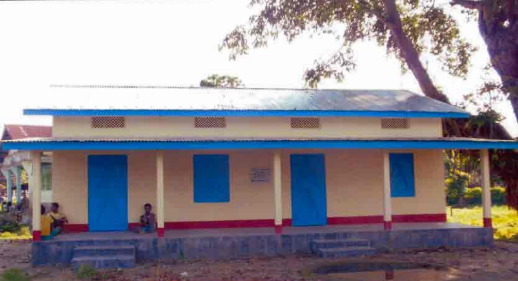
Community Hall constructed at Boitamari G.P. under 13th Finance Commission, 2011-12 (2nd Instl.) under Boitamari A.P.