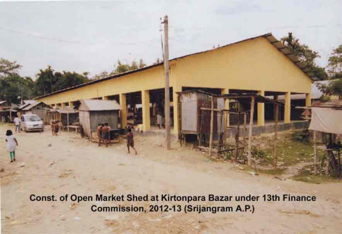
Const. of Open Market Shed at Kirtonpara Bazar under 13th Finance Commission, 2012-13 (Srijangram A.P.)