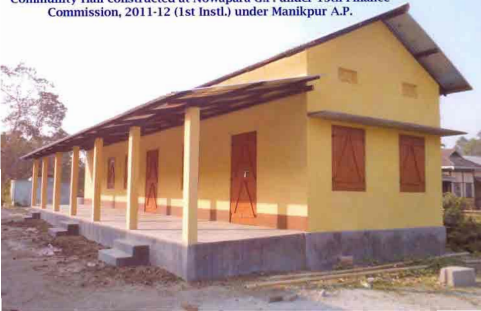
Community Hall constructed at Nowapara G.P. under 13th Finance Commission, 2011-12 (1st Instl.) under Manikpur A.P.