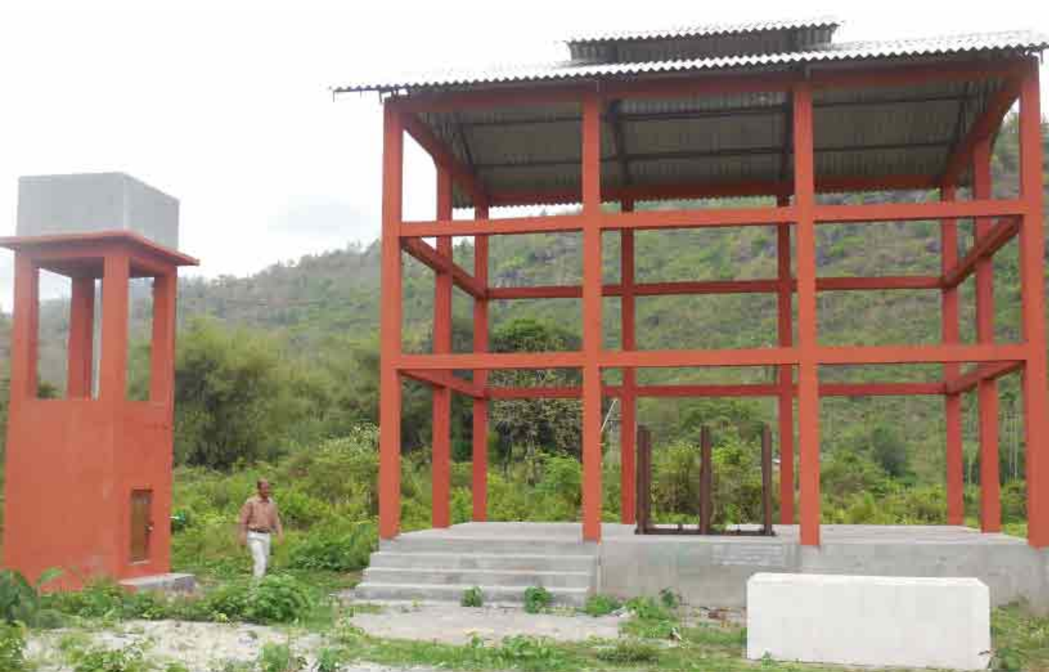
Const. of Jakuapara Cremation Ground under Bongaigaon G.P. under 13th Finance Commission, 2013-14