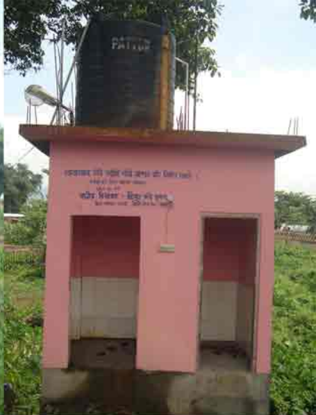
Const. of Cremation Ground at New Bongaigaon under 13th Finance Commission