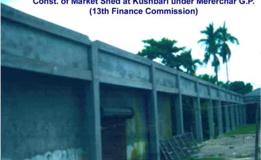
Const. of Market Shed at Kushbari under Mererchar G.P. (13th Finance Commission)