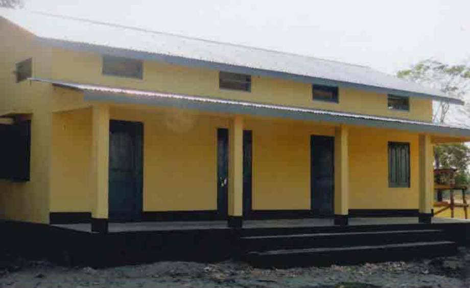
Community Hall constructed at Bashbari-Salabila G.P. office under 13th Finance Commission, 2012-13 (1st Instl.) under Manikpur A.P.