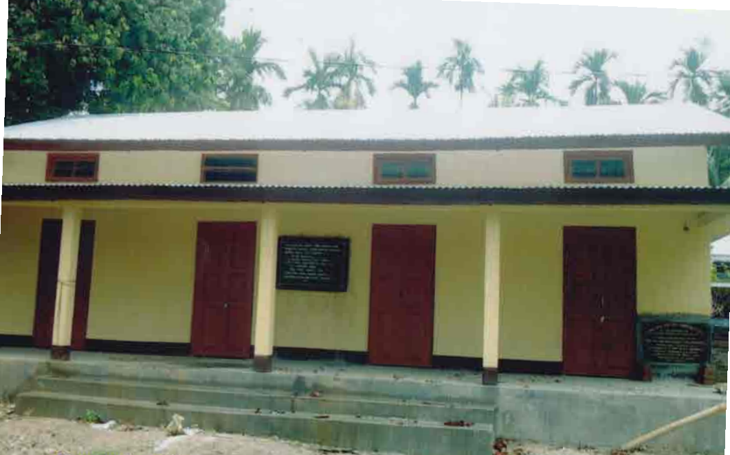
Community Hall constructed at Bongaigaon G.P. under 13th Finance Commission, 2011-12 (1st Instl.) under Dangtol A.P.