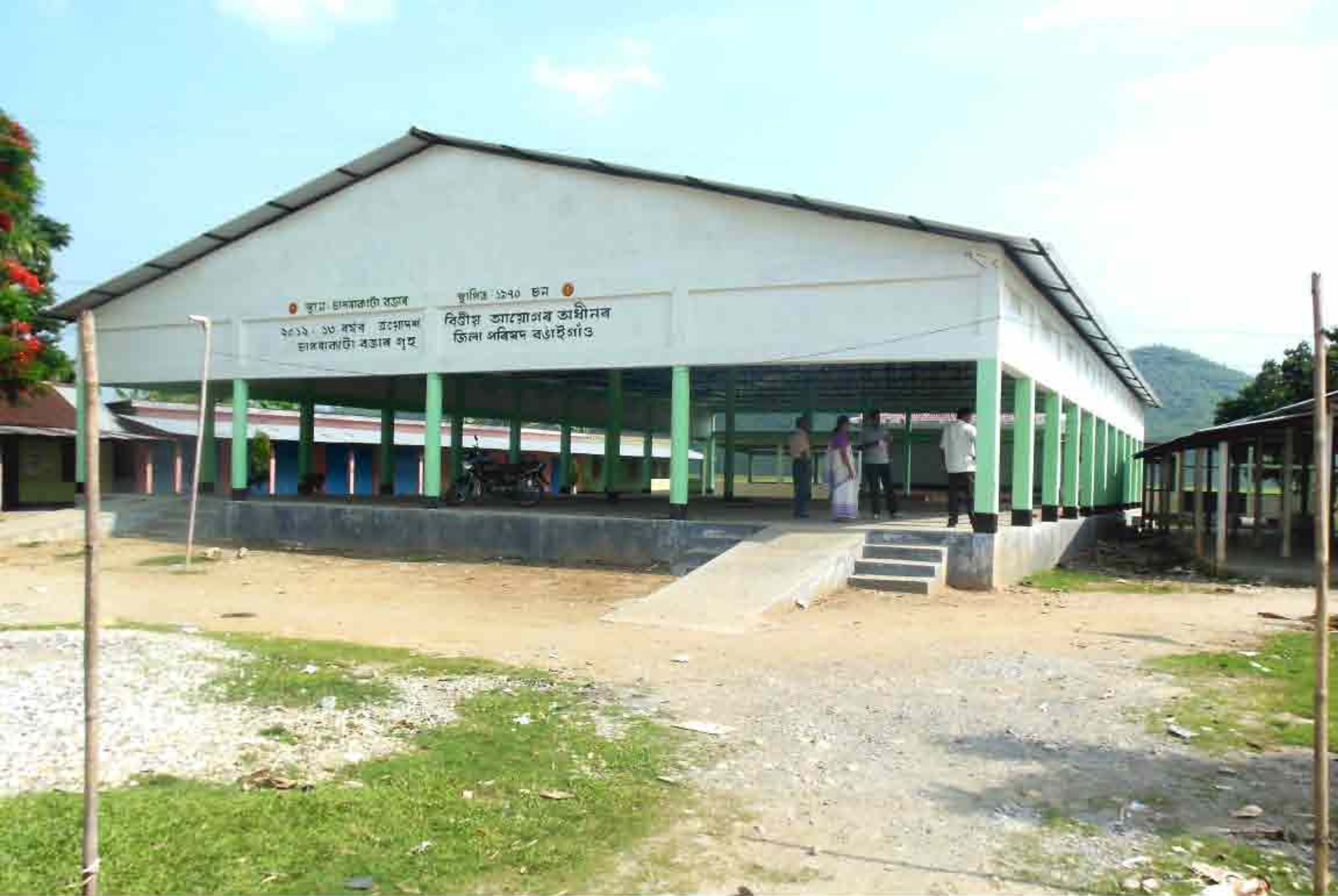
Const. of New Market Shed at Chaprakata Bazar under 13th Finance Commission, 2012-13 under Zilla Parishad, Bongaigaon