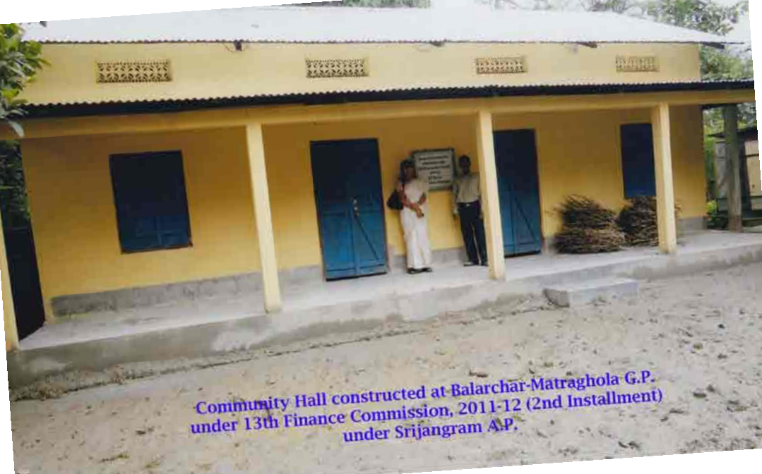
Community Hall constructed at Balarchar-Matraghola G.P. under 13th Finance Commission, 2011-12 (2nd Installment) under Srijangram A.P.