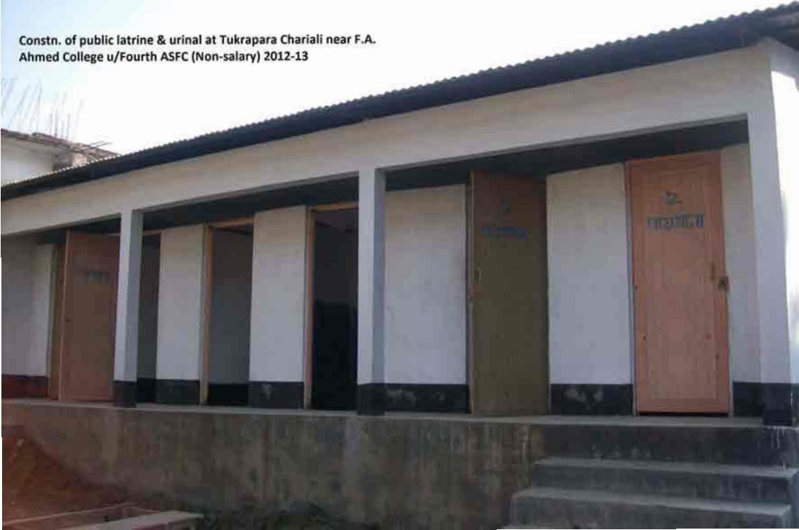
Constn. of public latrine & urinal at Tukrapara Chariali near F.A. Ahmed College u/Fourth ASFC (Non-salary) 2012-13