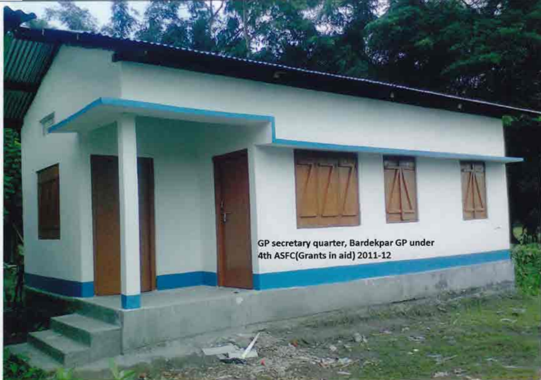
GP secretary quarter, Bardekpar GP under 4th ASFC(Grants in aid) 2011-12